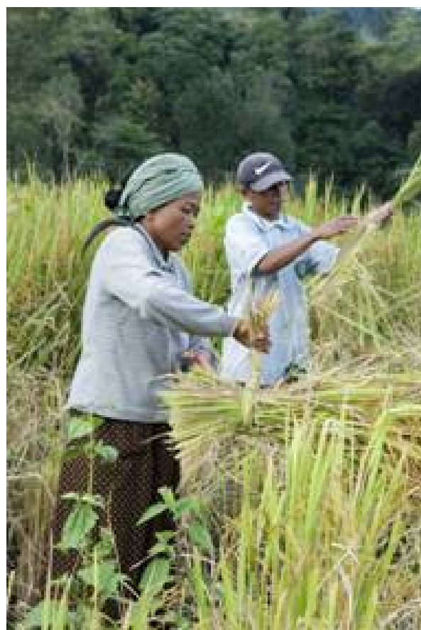
Cambodian farmers in the province of Koh Kong fear for their livelihood

concessions to private investors in order to boost public income and promote development in poor rural regions. In most cases, however, land allocation has not occurred according to legal requirements and with the said objectives, but has only served to enrich the corrupt elite. It is estimated that by the end of the 90s, over a third of the rural population was evicted from its ancestral land to create farmland and forestry concessions.