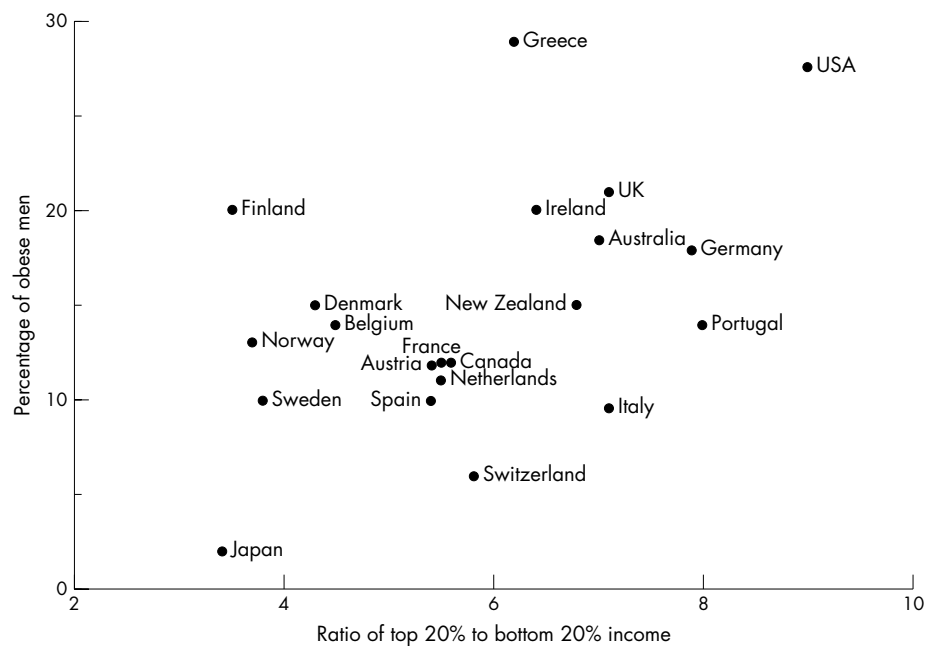
Figure 1 The relation between male obesity and income inequality in 21 rich countries.

most unequal. Gini coefficients of inequality from the same source were also investigated. The Gini coefficient is a measure of income inequality that varies between 0 (equality) and 1 (maximum inequality). 16